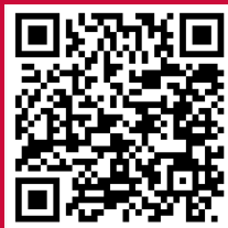
LAB TOUR BOOKING