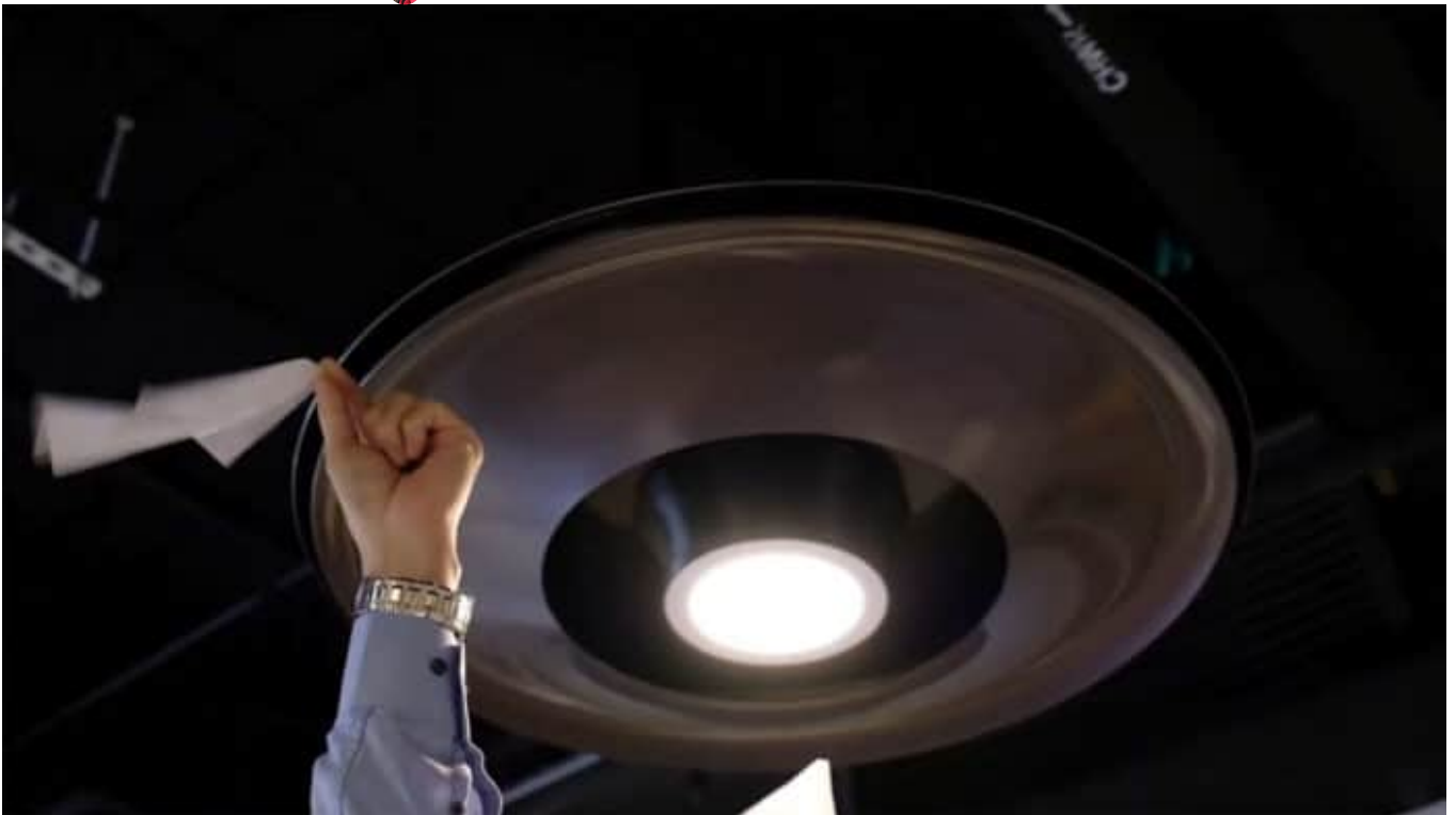
Bladeless Vortec ceiling fan speeds up cooling while saving energy.

BY ASHWINI SAKHARKAR NOVEMBER 2, 2020 EMERGING TECH