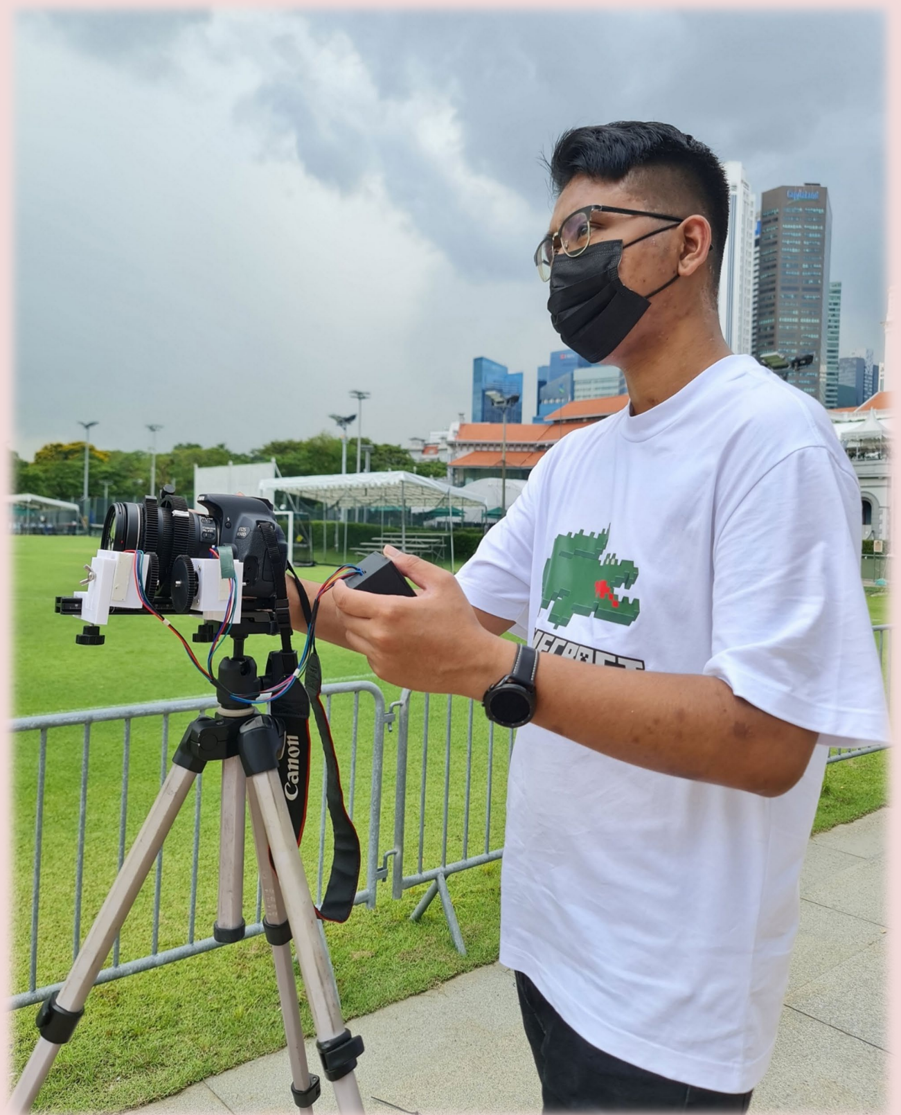
📷 The ICM Buddy attached to a DSLR