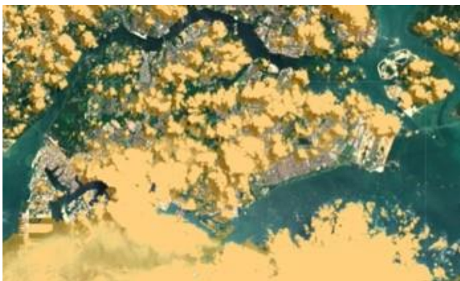
Cloud detection using s2cloudless

QA60, s2cloudless and Fmask were implemented on S2 datasets. s2cloudless was found to be the most ideal cloud removal method among the three for S2 images.