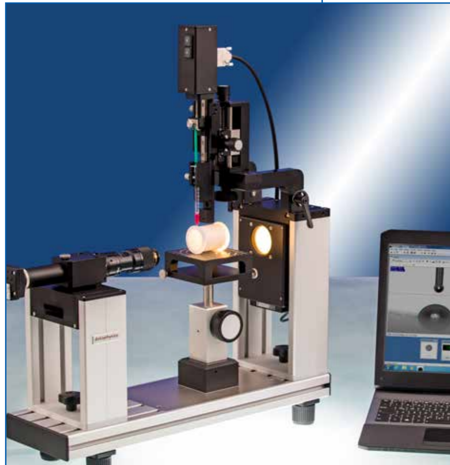
OCA 15EC Package 1 incl. SD-DM, ESr-D, SCA 20, and SCA 21