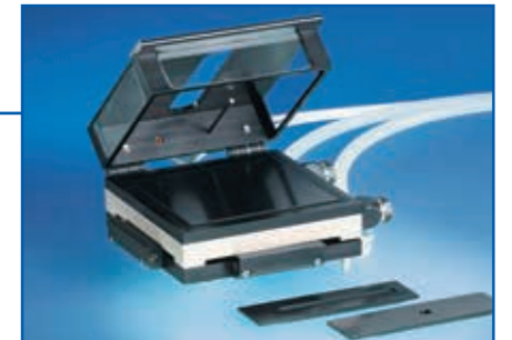
Liquid temperature control unit TFC 100Pro

sive contributions, based on the analysis of the drop shape of pendant drops