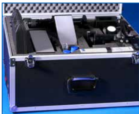
Transport case TBO for OCA 15EC