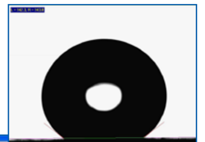
Water drop on an ultrahydrophobic substrate