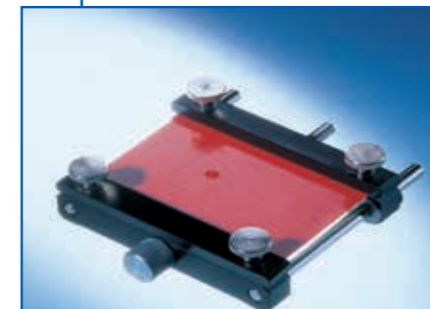
Film sample holder FSC 80