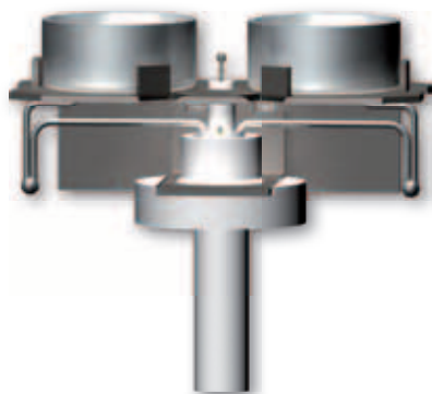
Plate-shaped DSC rod

The DSC131 evo transducer has been designed using plate-shaped DSC rod technology and is constructed from chromel-constantan.