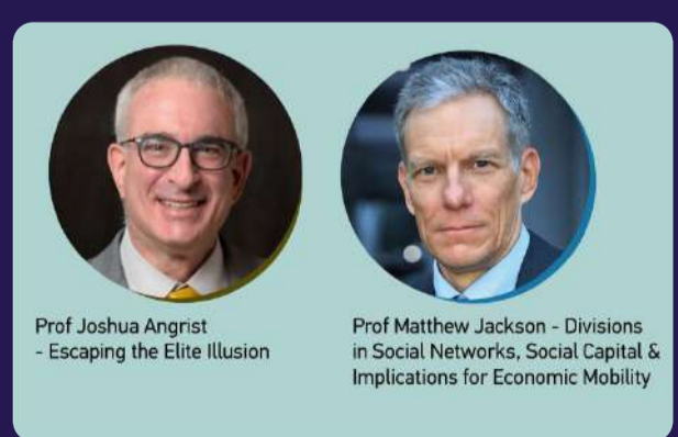
Prof Joshua Angrist - Escaping the Elite Illusion