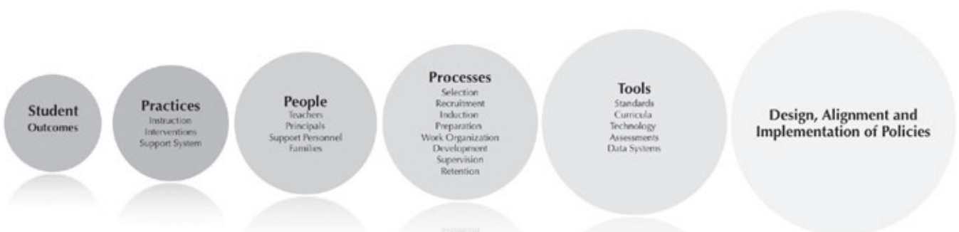
Figure 1: Alignment between different elements of the educational ecosystem.

However, placing a high value on education is only part of the equation. The belief in the possibility that all children can achieve success also plays a significant role. In most high-performing countries, it is the responsibility of schools and teachers to engage with the diversity of student interests, capacities, and socio-economic contexts. Parents, teachers, and the public at large embrace the shared belief that all students are capable of achieving high standards and that they need to do so. They serve as exemplars of how public policies can support the achievement of universal high standards.