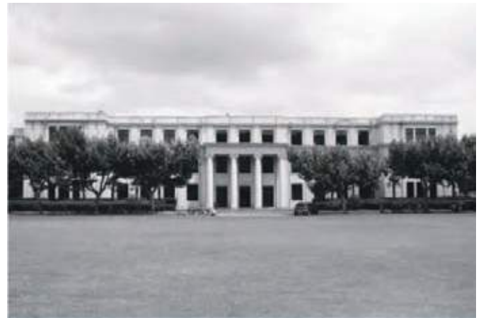
Figure 3: Arts and History Building in ECNU.

ECNU was established as a normal university in 1952, with a historic mandate for teacher education. It was given the heritage and campus of a major private university from the Nationalist period. While education is a core focus, there are also advanced programmes in the sciences and humanities, and education serves to integrate these diverse fields. Being a national university under the Ministry of Education, ECNU also has strong support from the Shanghai government.