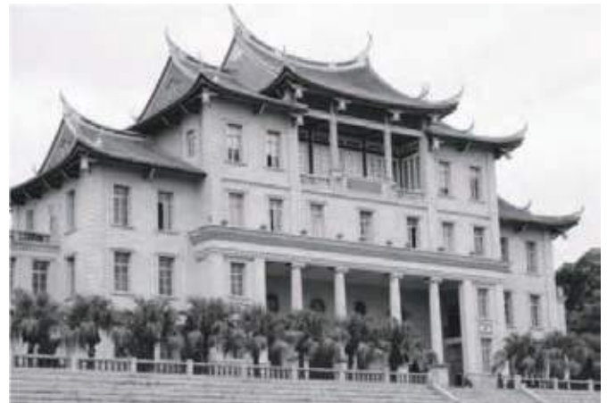
Figure 5: Jiannan Auditorium in Xiamen University.

a consortium of other universities also located near the ocean. Though marine studies is one of its focal areas, economics is one of their strengths, while having China's leading centre of higher education research.