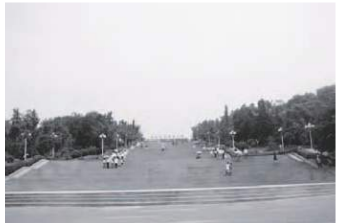
Figure 6: The 93 steps in NWAUFU.

NWAFU was formed from a merger of two universities and five research institutes. Although a comprehensive university, NWAFU has chosen to stay close to its roots in agriculture, partnering universities in the West to focus on all aspects of food production, learning and research.