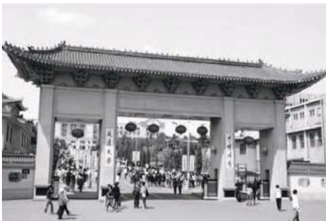
Figure 7: Main gate in YBU.

YBU is a major institution in China's northeast that serves a minority Korean population. The university was originally provincial level, mainly serving the local Korean community by training local officials and teachers who could teach in Korean. Originally, it did not have a very high status, but they managed to be included in the Project 21/1, which provides financial support for 100 leading universities to reach world standards.