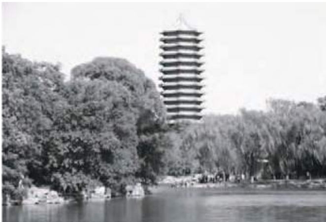
Figure 2: Unnamed lake in Beida.

Beida calls itself the leader of Chinese culture. “Leading culture” is both a historical mandate and the first phrase in the university’s new mission statement. Faculty members feel a sense of responsibility to take up the role of being critical purveyors of the Beida mission of leading culture wherever they go. Beida students also feel very much that they have strong international connections and a role of bringing Chinese culture to the world though they are hesitant as to where they have to go with that.