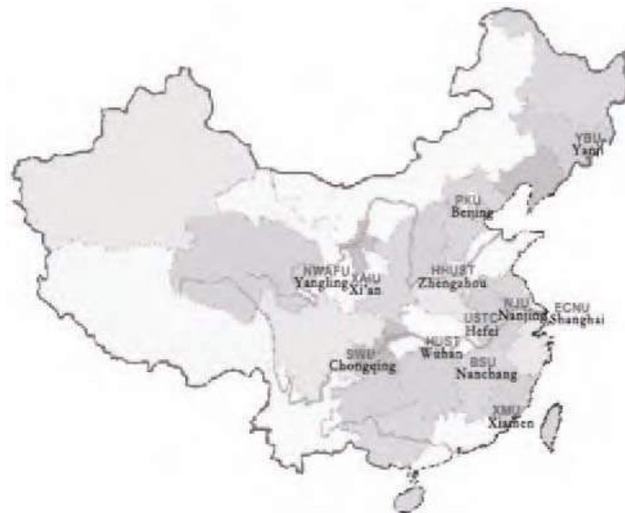
Figure 1: Map of the locations of the case universities in this study.

This lecture focuses on 6 of those 12 universities: Peking University (Beida) in Beijing; East China Normal University (ECNU) in Shanghai; Huazhong University of Science and Technology (HUST) in Wuhan, Hubei Province; Xiamen University in Xiamen, Fujian Province; Northwest University of Agriculture and Forestry (NWAUFU) in Yangling, Shaanxi Province; and Yanbian University (YBU) in Yanji, Jilin Province.