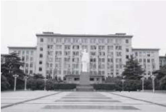
Figure 4: South Building in HUST.

Established in 1952, HUST is an engineer's paradise. The physical campus has clear, linear paths to orient yourself to the campus surroundings easily. It also offers very advanced engineering programmes, which attracts very good students, including a lot of rural students.